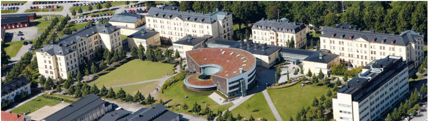
Campus of Högskolan i Gävle / (www.hig.se)