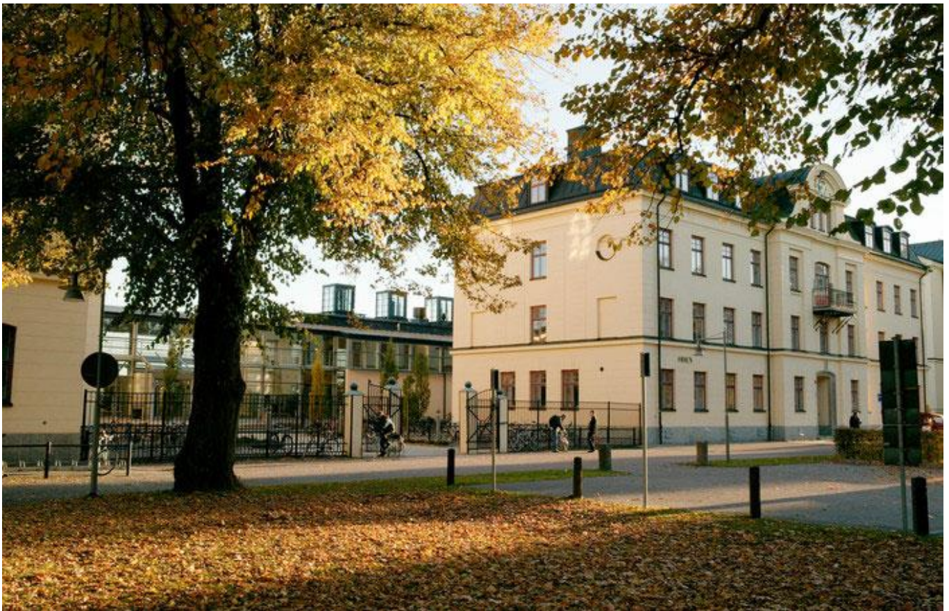
Main entrance of Högskolan i Gävle

The ATC4 will be hosted by University of Gävle ( Högskolan i Gävle ), located at the city of Gävle, in Sweden. Founded in 1977, the university is placed at rebuilt facilities previously occupied by an infantry regiment of Swedish army. The university was environmentally certified according to ISO 14001, has approximately 16,000 students, and offers courses in the fields of Humanities, Social Sciences, Natural Sciences, and Technology.