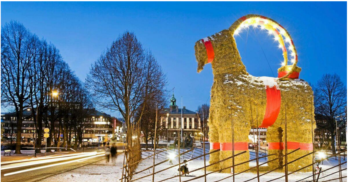
Gävlebocken (the Gävle Goat)

Let's hope the SAPIENS Teams visit in 2022 preannounces a better fate to the Christmas goat.