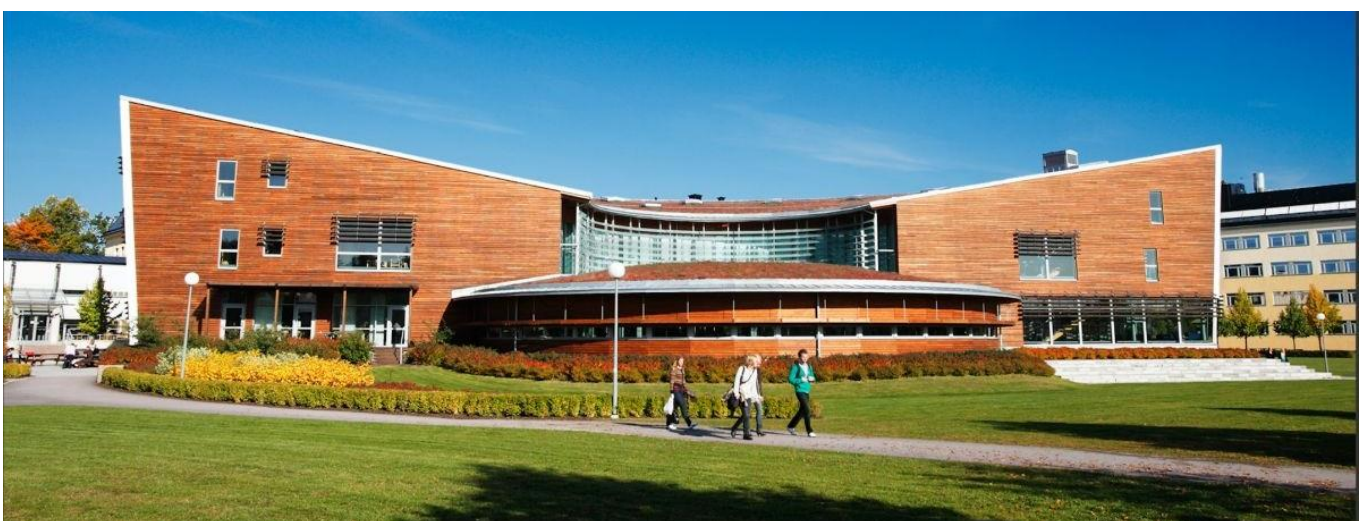
Library of Högskolan i Gävle / (www.hig.se)