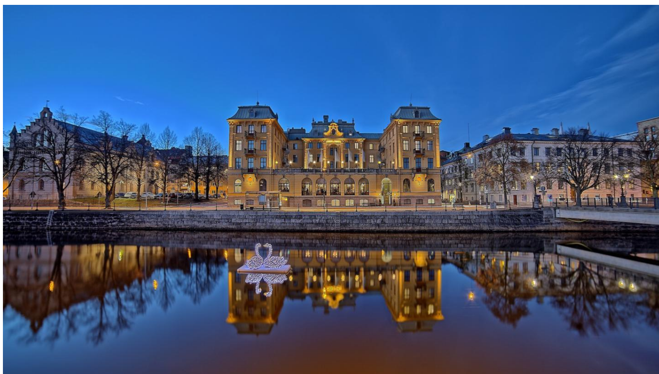
Elite Grand Hotel at the margin of Gavleån (river of Gävle)